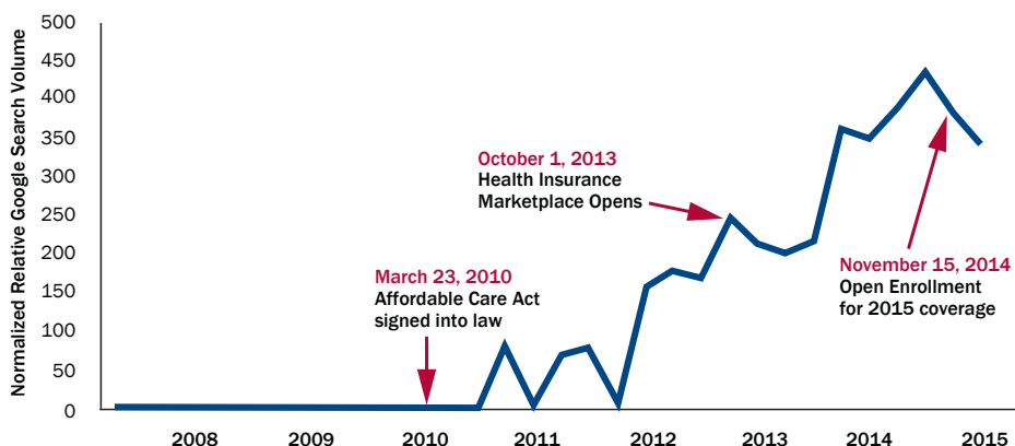
Figure 1. Public Interest in Narrow Networks as Tracked by Google Trends

Narrow networks leave consumers vulnerable to the financial burden of out-of-network care; the challenge of navigating between in-network providers increases as the network size decreases. As a result, network size, even as a broad concept, is an important feature of a plan. Yet surveys and other anecdotal reports suggest that many consumers who selected narrow network plans largely on the basis of lower premiums were unaware of the network size of the plan they selected. Information on networks specific to specialty or geography is mostly non-existent.